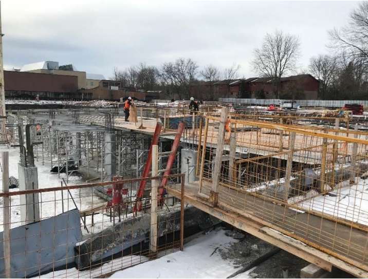
View looking South West