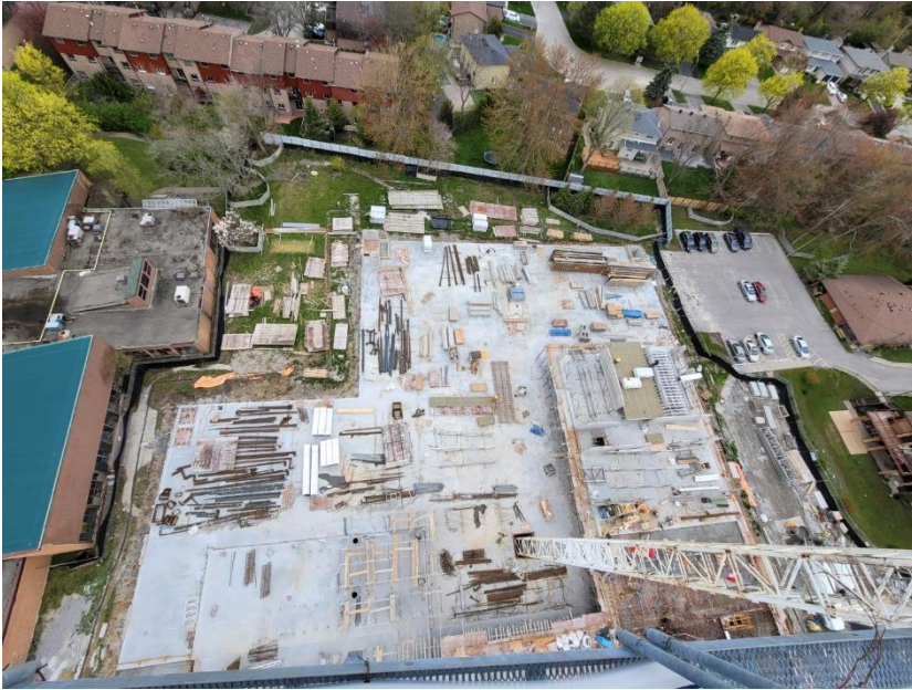
View from Crane