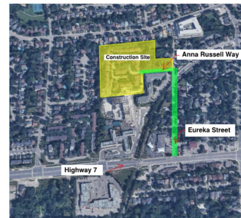
Figure 1 – Construction Route/Access