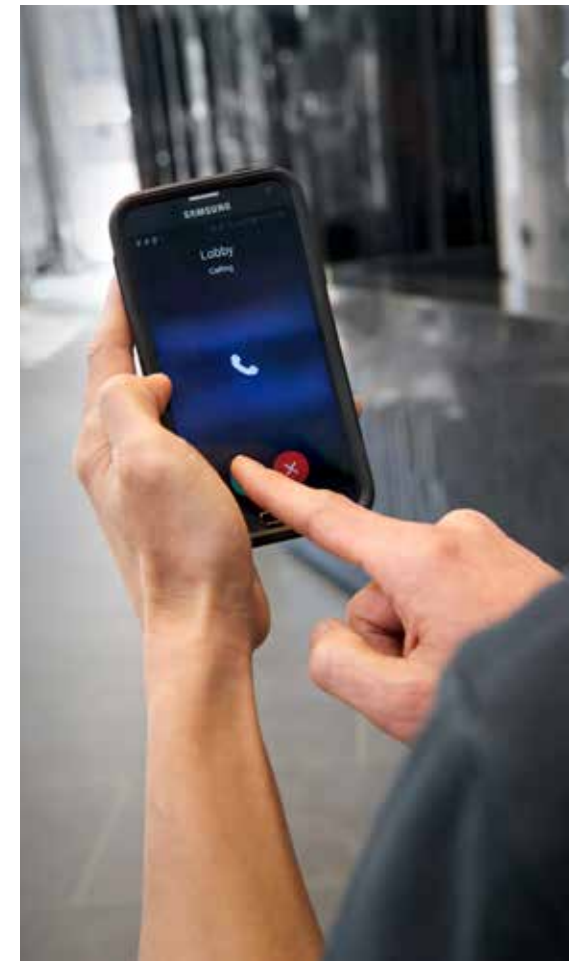
Minto Communities Mobile App

Enjoy high-speed internet within your suite and throughout the building. Unlimited data included in your monthly maintenance fee.