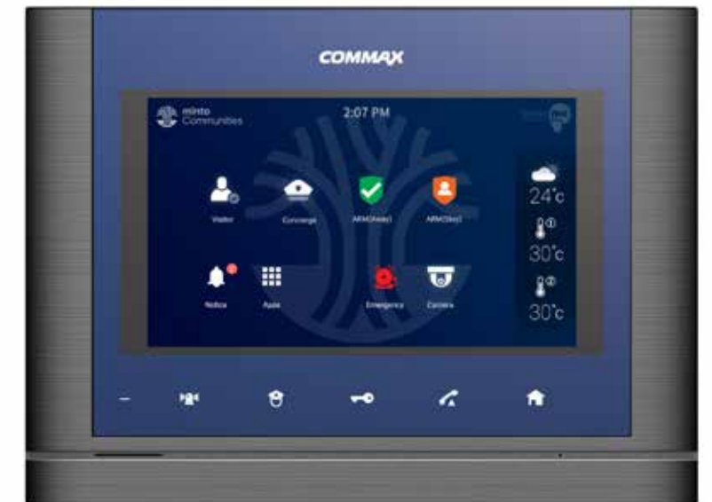
In-suite System Control Touch Pad