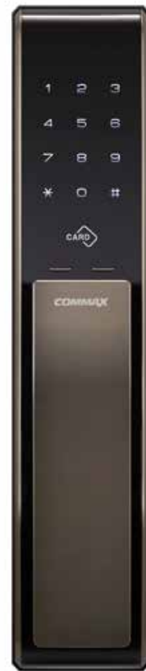
Digital Smart Lock

Manage all your household functions from your in-suite wall pad or smartphone. SmartOne Solutions makes it easy to set the alarm, adjust the temperature and monitor your visitors with live, one-way video from the lobby or parking garage and grant entry to the lobby. You can also quickly check the weather, get building updates, book facilities and access suite manuals in home or conveniently on the app.