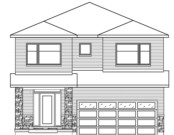
FRONT ELEVATION 'D'