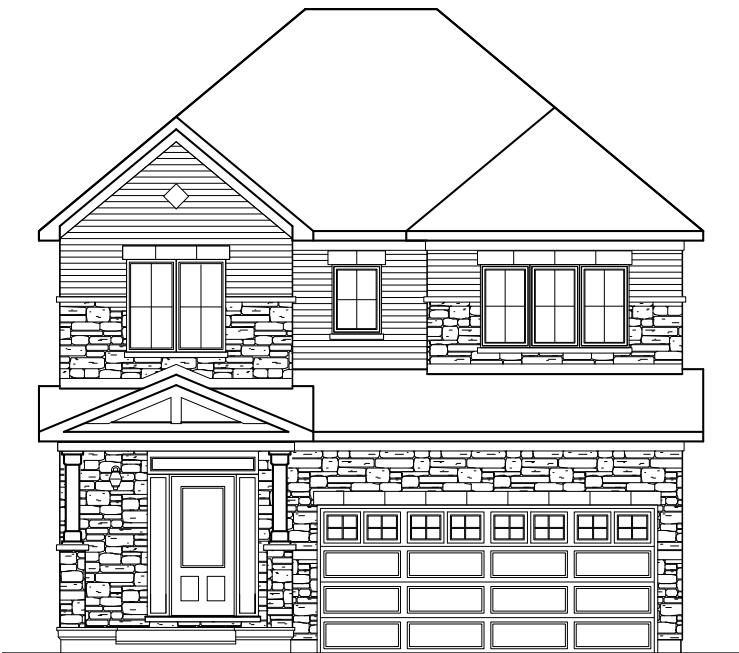
FRONT ELEVATION 'C'