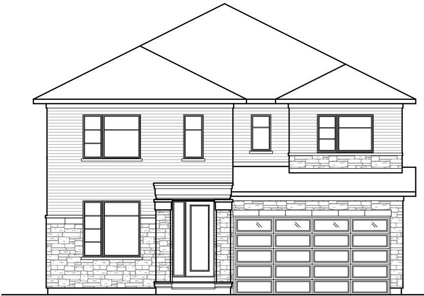
FRONT ELEVATION C